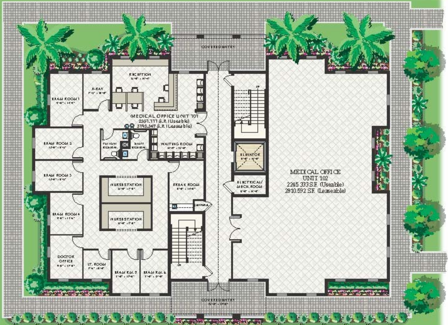
VANDERBILT PROFESSIONAL CENTER MEDICAL BUILDING 1 ST LEVEL FLOOR PLAN